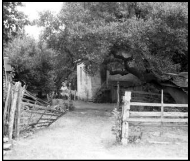
Rock building in Dubina, a ghost town in Fayette County, Texas (ITC 73-974 )

Teachers: Specific TEKS applications and planning aids for your grade level are at www.texancultures.utsa.edu X