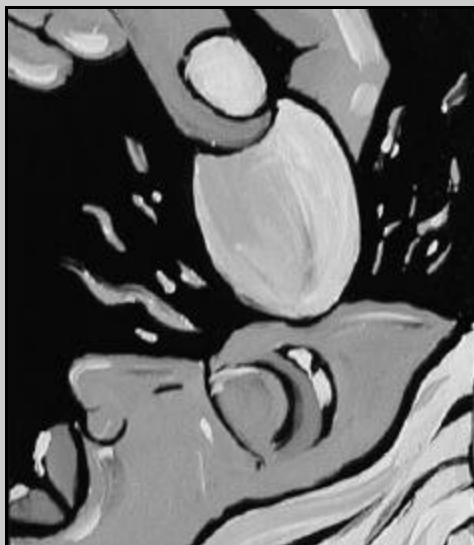
El Mal de Ojo: The Evil Eye